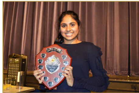
Best House Play Nightingale