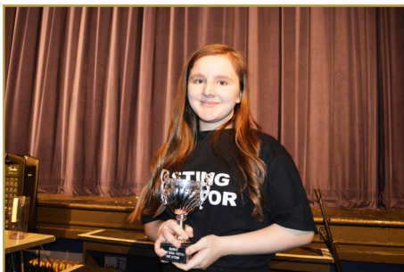
Best Actress Kiera